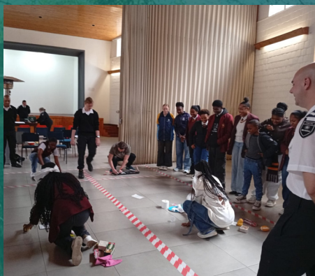
Cadets partake in fun activities at the Johannesburg Centre in Braamfontein. This year, over 50 proficiency badges have been awarded to cadets nationwide, showing growing interest in the Cadet Badgework Programme.

Across the country, our focus on Proficiency Badge work has strengthened the skills and confidence of young members, ensuring they are equipped to serve effectively within their schools and communities. This year has seen dozens of Proficiency Badges issued from Johannesburg to Kimberley and KuGompo City.