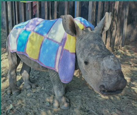
A little White Rhino proudly showcases a knitted blanket.