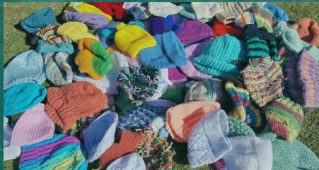
Dozens of beanies knitted by Stella Londt crafters over many hours for underprivileged children. Contents form part of a larger consignment of knitted wear that will be distributed on Mandela Day (18 July 2026), to those in need.

Our first initiative involves making beanies and blankets for underprivileged children, which will be distributed on Mandela Day (18th July). The late Nelson Mandela, a Bailiff Grand Cross of our Order, encouraged a culture of volunteerism and supporting those less fortunate, a prerogative our residents fully empathise with. While Mandela Day only encourages 67 min of service, our crafters have gone way beyond that in supporting this noble cause.