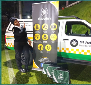
Kitted and ready to go! Our volunteers have contributed over 3,438 volunteer hours, many of which have taken place at sporting events, alongside fields, as shown.

Together, we have strengthened the Brigade through enhanced training programmes, expanded recruitment of healthcare professionals and home-based carers and improved operational readiness. We have also invested in mentorship, leadership development and succession planning to ensure a sustainable future for our Brigade.