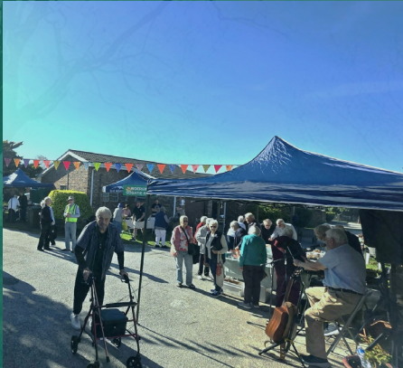
Family Food Market Day at Stella Londt was a great success. With live music, numerous food stalls and clear blue skies, residents, family and friends enjoyed a fun day while raising funds for Stella Londt projects.

I value every resident and am grateful to all of them, including our staff and support workers who contribute positively to building a strong sense of community, both within our village and in the wider community we serve.