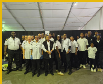
St John Brigade volunteers from Durban at the finishing medical tent for this year's Comrades Marathon.