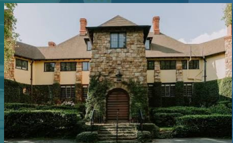
Glenshiel, Priory headquarters of St John South Africa.

We are pleased to report that the organisation has maintained its strong audit track record, receiving a clean (unqualified) audit opinion for three consecutive years. This achievement demonstrates the Finance team's commitment to sound financial management, regulatory compliance, and robust governance practices. The FY2026 audit is presently in progress, with an anticipated sign-off date of September 2026.