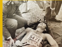
St John Brigade volunteer assists a runner at the 1980 marathon.

to honour fallen soldiers of World War I. The June 2026 edition marked the 99th running of the race in its 105 year history due to cancellations brought on from World War II and COVID-19. While research is needed to establish when the Brigade first started to cover the event, it is likely from very very early on.