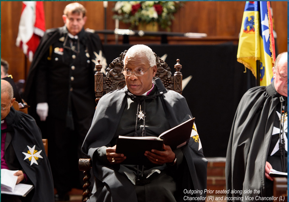
Outgoing Prior seated alongside the Chancellor (R) and incoming Vice Chancellor (L)