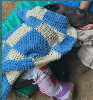
Little orphaned rhino wrapped up in its blanket.

This project holds special significance, highlighting the ongoing impact of rhino poaching across Africa. The blankets are destined for orphaned rhino calves rescued after losing their mothers to poachers. Often found alone in the veld, these vulnerable animals are taken to sanctuaries where dedicated handlers provide round-the-clock care and become their surrogate mothers.