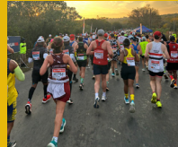
Runners on their 86 km journey from Durban to Pietermaritzburg.

The Comrades Marathon is the longest and oldest timed ultramarathon in the world, first run in 1921