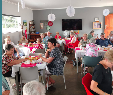
Residents enjoying tea and cake at Stella Londt Retirement Village.

Throughout the year, residents participated in a variety of group activities. One of our most meaningful initiatives is the knitting of beanies and blankets for children's homes and baby homes in support of Mandela Day. This project reflects our commitment to giving back and making a difference in the lives of others. Our calendar to date has also included a much-anticipated fundraising event, the Family Food Market Day, and we are looking forward to our Book Sale & Market which will be hosted towards the end of the year.