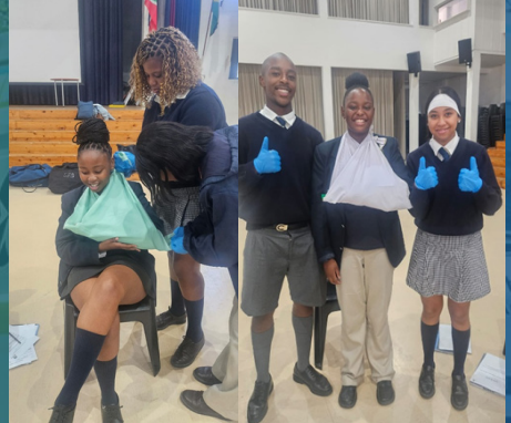
Learners at Christel House South Africa completing the 'Lifesaver' course.