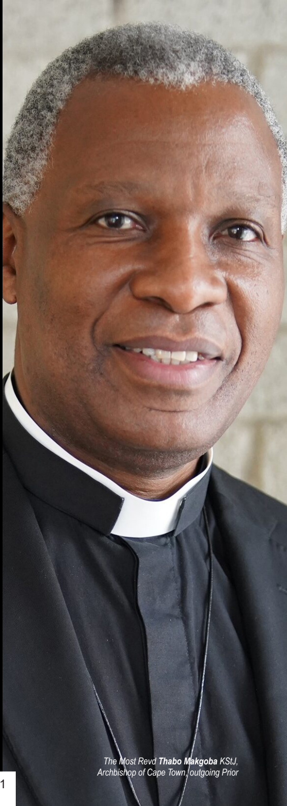
The Most Revd Thabo Makgoba KStJ, Archbishop of Cape Town, outgoing Prior

Immediate past Prior Archbishop Thabo Makgoba KStJ