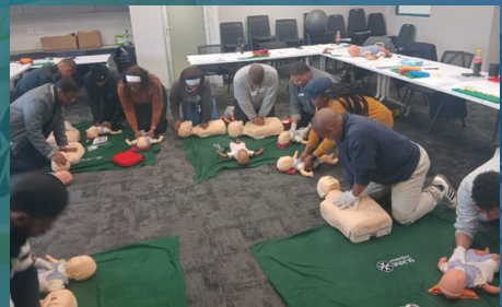
Public first aid class practising CPR – Highly Interactive practice sessions are the hallmark of our training. We emphasise effective and efficient CPR to create competent and confident lay rescuers.

The training landscape in occupational health and safety, as well as first aid, is very volatile with fierce competition in the industry. St John remains a respected name in the training industry, but to navigate the training landscape, we must work smarter and diversify our offerings. Through market research, we have determined that our clients require a one-stop shop for occupational health and safety. We would have to look at diversifying and expanding our product offerings.