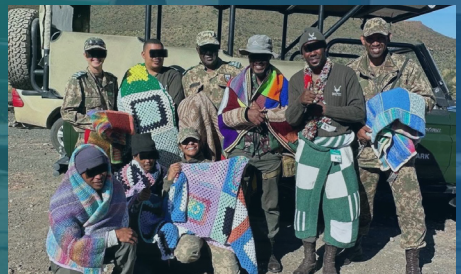
Rhino 'parents' with their blankets. Rangers often have to spend cold nights in the bush watching over their precious adoptees.

The handmade blankets help keep both the young rhinos and their handlers warm during the critical early stages of rehabilitation. Through the support of the UK-based non-profit organisation Blankets for Baby Rhinos , which has collection agents across South Africa, the blankets will be distributed to sanctuaries where they are needed most.